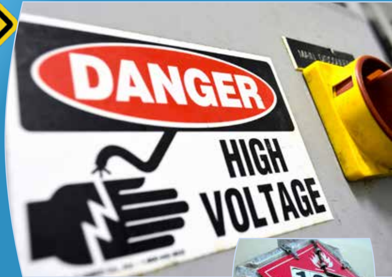
High Risk Pavilion