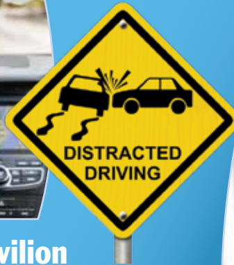
Distracted Driving Pavilion